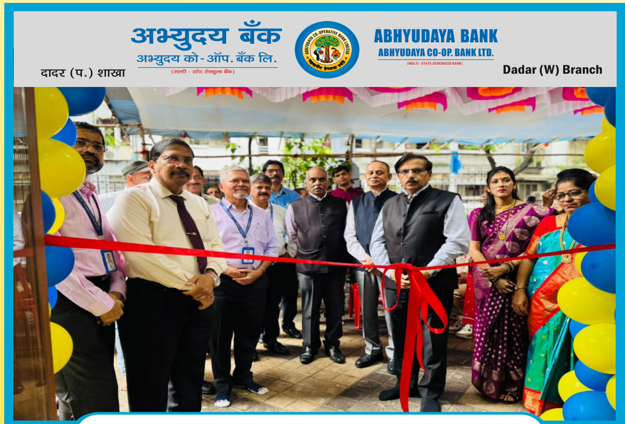
Dadar Branch Shifting to New Premises