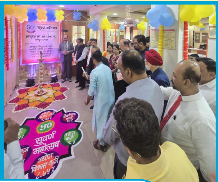
Bhandup Branch Golden Jubilee 50 th Anniversary