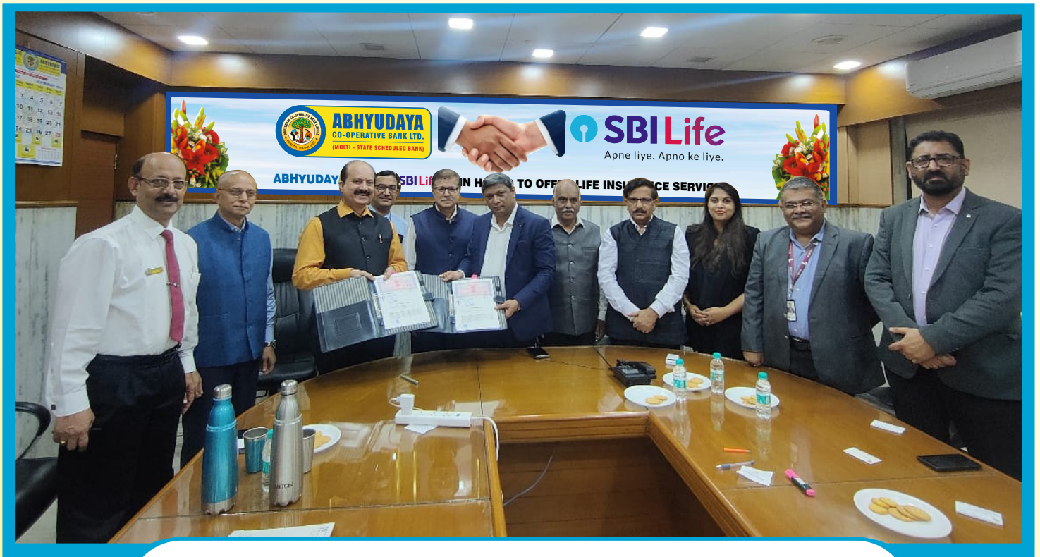
ABHYUDAYA BANK & SBI Life JOIN HANDS TO OFFER LIFE INSURANCE SERVICES