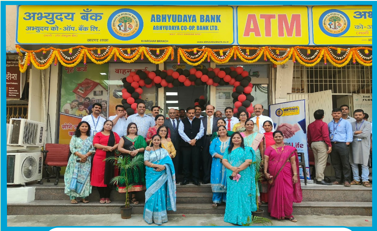
Kharghar Branch Shifting to New Premises