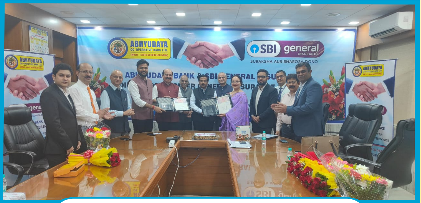
ABHYUDAYA BANK & SBI GENERAL INSURANCE JOIN HANDS TO OFFER GENERAL INSURANCE SERVICES