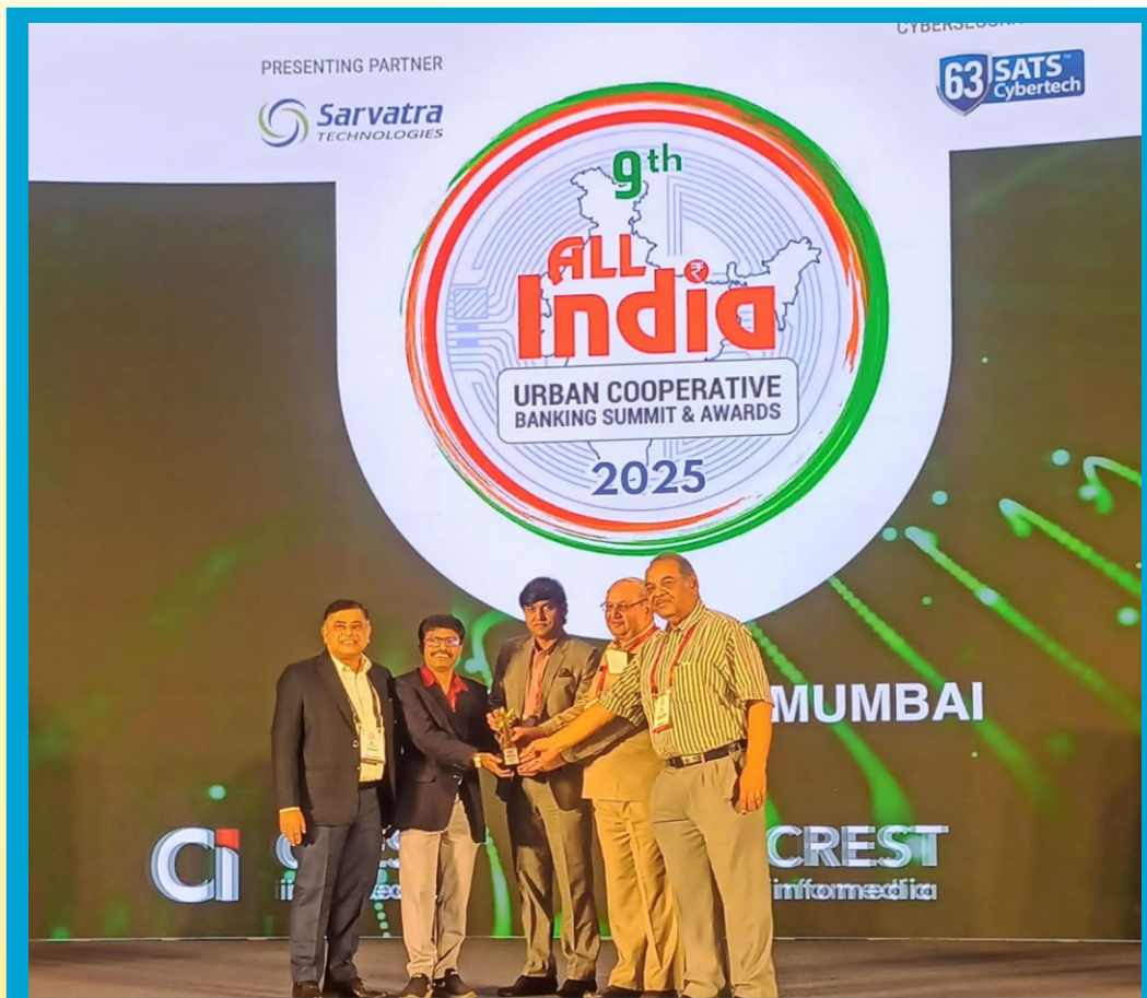
Abhyudaya Bank Awarded for “Mobile Banking Category” at All India Co-op. Banking Summit held by NAFCUB for the period of 2024-25.