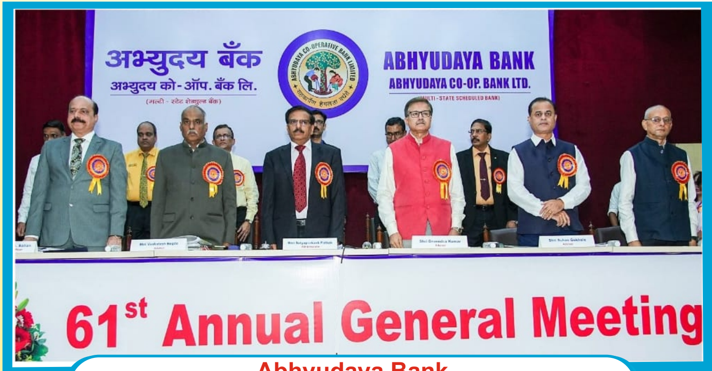
Abhyudaya Bank 61 st Annual General Meeting 2024