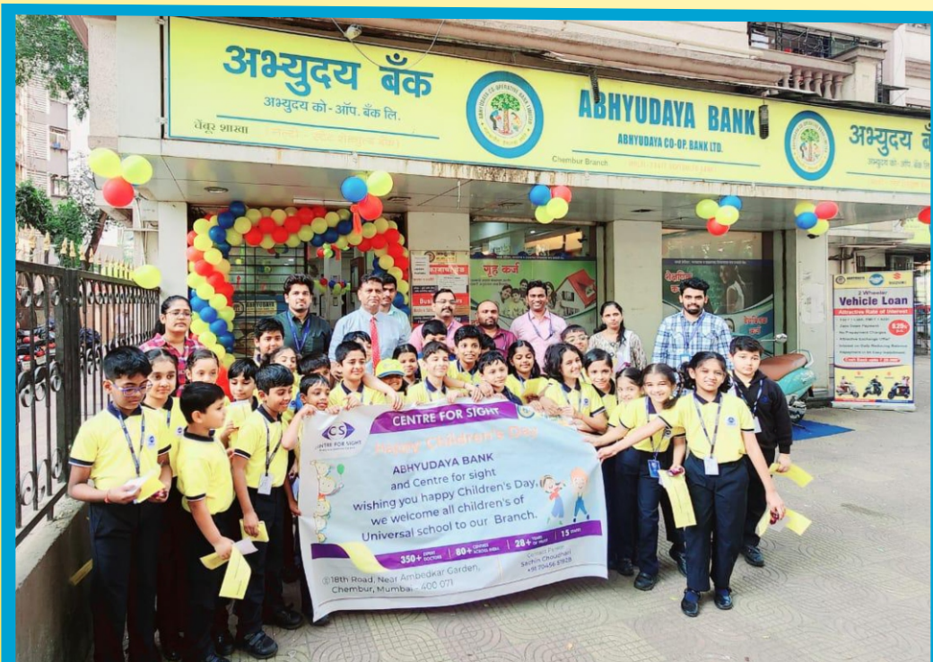
Field visit by School children at Abhyudaya Bank Chembur Branch